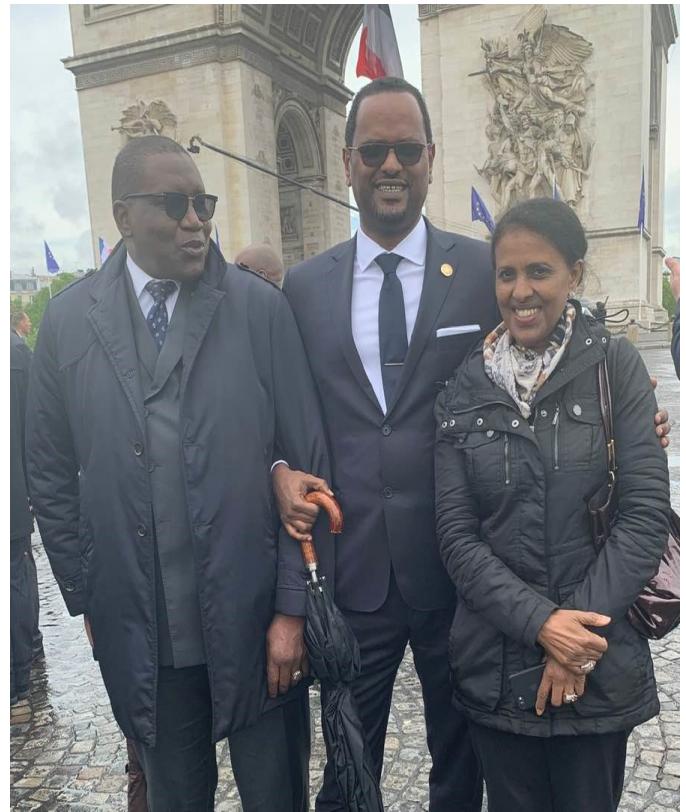
H.E Ambassador Henok Teferra with the Prime Minister Édouard Philippe and African Ambassadors during the France national day in Paris.